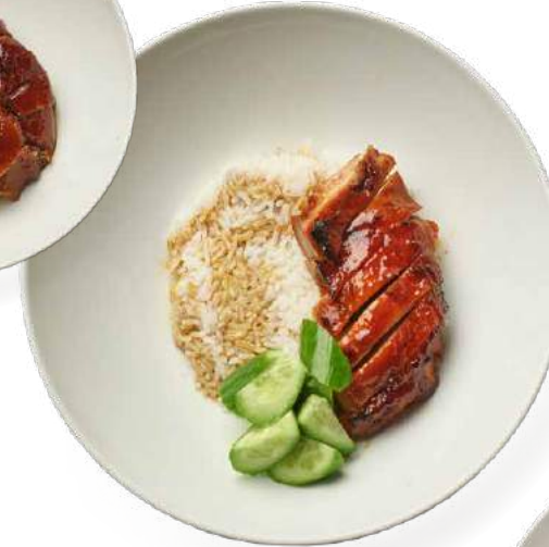
55 CHAR SIU CHICKEN RICE 雞叉燒飯 $24.00