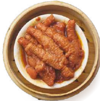
05 CHICKEN FEET WITH BLACK BEAN 豉汁蒸鳳爪 $10.00