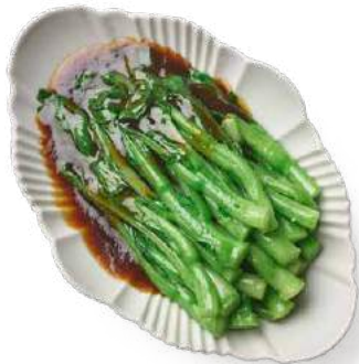
61 CHOI SUM WITH OYSTER SAUCE 蠔油汁菜心 $16.00