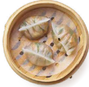
10 CHIU CHOW DUMPLING 潮州蒸粉粿 $10.00