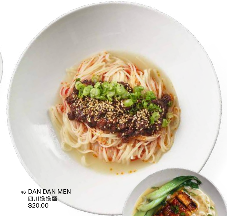
46 DAN DAN MEN 四川擔擔麵 $20.00