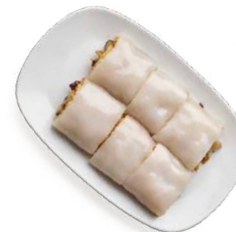
26 WILD MUSHROOM AND CRISPY YUBA CHEUNG FUN 腐皮香蕈腸粉 $10.00