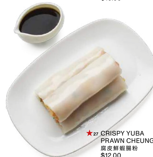
27 CRISPY YUBA PRAWN CHEUNG FUN 腐皮鮮蝦腸粉 $12.00