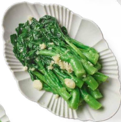
62 GAI LAN WITH GINGER AND GARLIC 芥蘭炒蒜蓉, 姜 $16.00