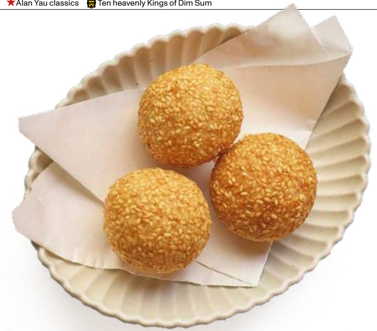
20 FRIED MOCHI WITH SWEET LOTUS SEED PASTE 蓮蓉煎堆籽 $8.00