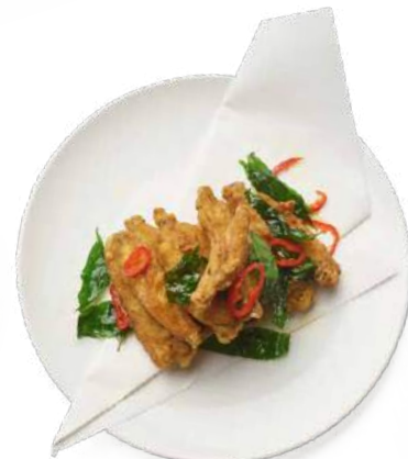
40 CHICKEN WINGS THAI CHILLI & CURRY LEAF 咖哩葉油烹雞翅 $24.00