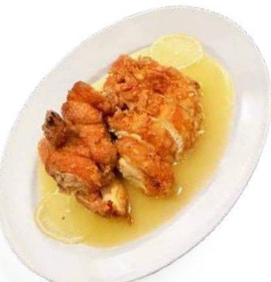
43 LEMON CHICKEN 酥炸檸檬雞 $26.00