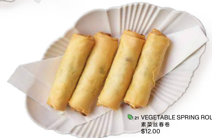
21 VEGETABLE SPRING ROLL 素菜絲春卷 $12.00