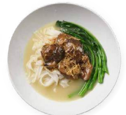
48 SHIITAKE & DRIED SCALLOP HO FUN SOUP 花菇瑤柱河粉湯 $26.00