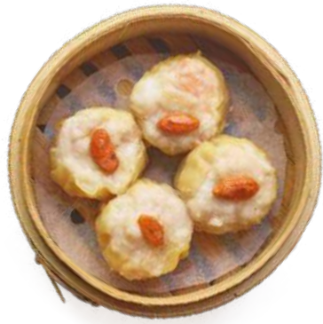
02 SHUMAI 猪肉蝦燒賣 $12.00