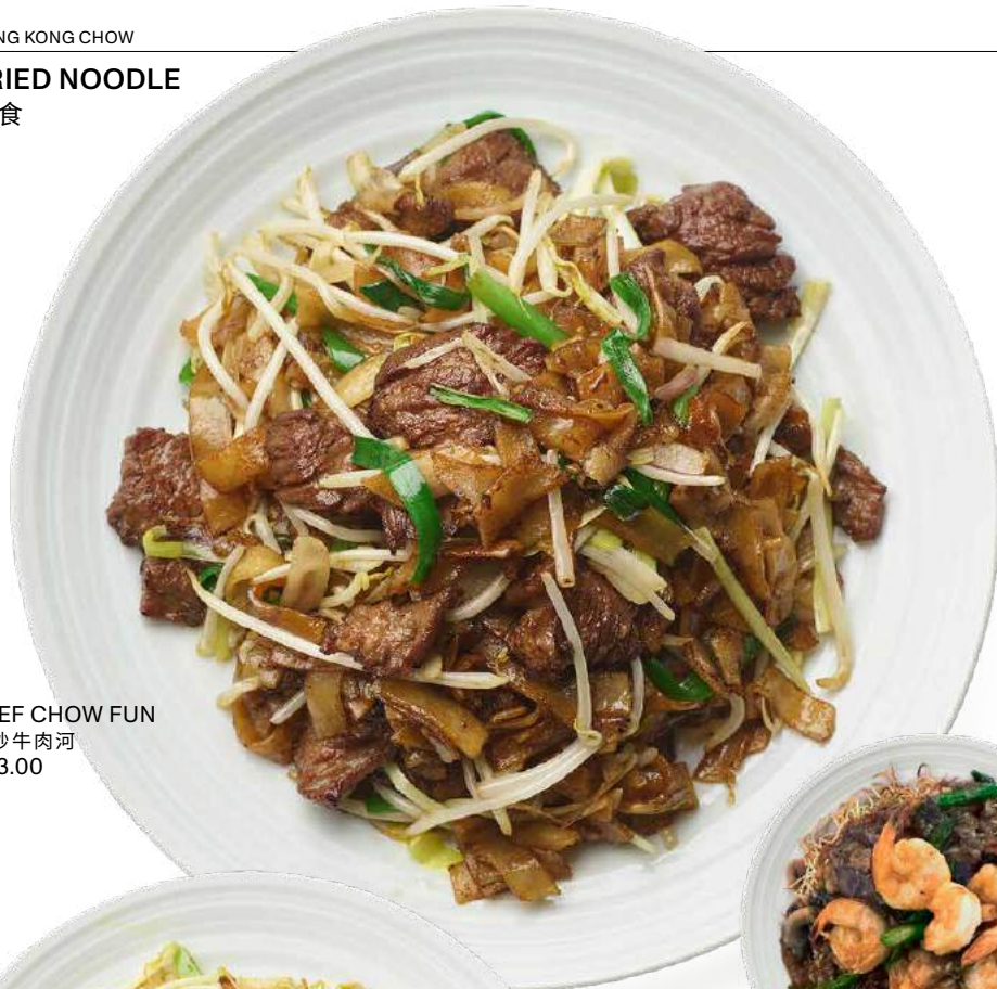
49 BEEF CHOW FUN 干炒牛肉河 $23.00