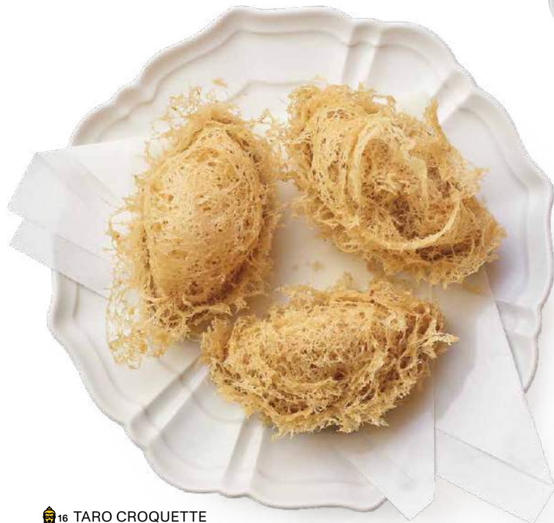
16 TARO CROQUETTE 蜂巢荔芋角 $10.00