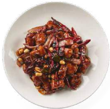
41 KUNG PAO CHICKEN 宮保雞丁 $26.00