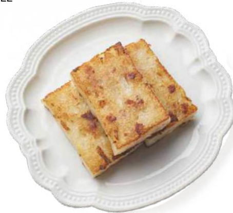
18 PAN FRIED MOOLI CAKE 香煎萝卜糕 $8.00