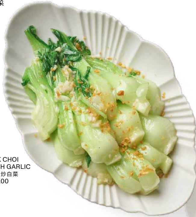
60 PAK CHOI WITH GARLIC 蒜蓉炒白菜 $16.00