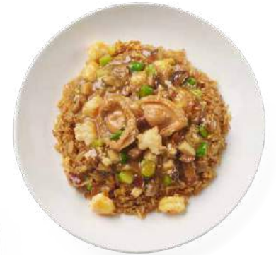
57 HOKKIEN FRIED RICE 鮑魚福建炒飯 $33.00