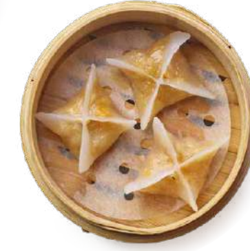
12 SQUASH AND PINE NUT DUMPLING 南瓜風車餃 $10.00