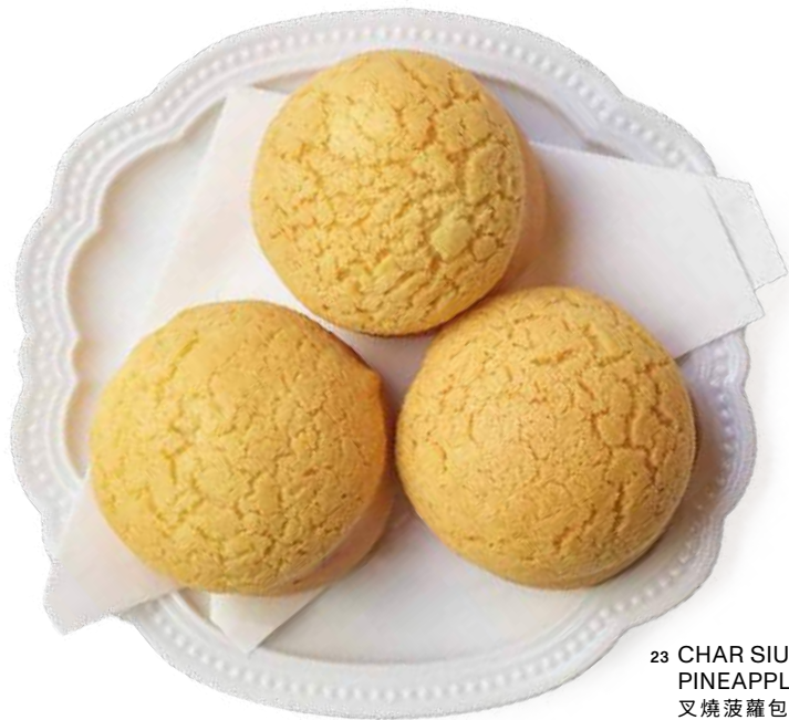
23 CHAR SIU PINEAPPLE BUN 叉燒菠蘿包 $8.00