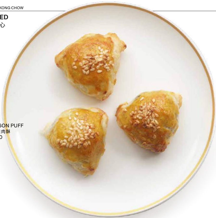
22 VENISON PUFF 蜜汁鹿肉酥 $12.00