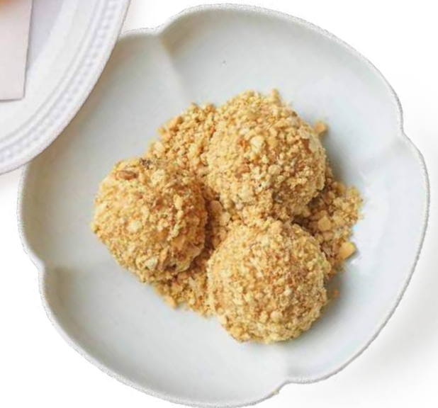
66 BLACK SESAME MOCHI, CRUSHED PEANUT 黑芝麻雷沙湯圓 $8.00