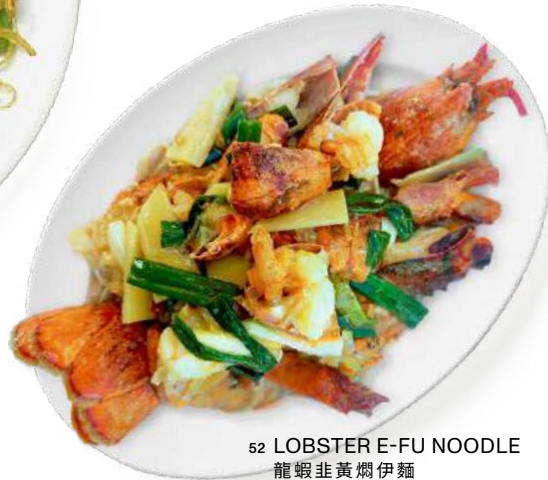
52 LOBSTER E-FU NOODLE 龍蝦韭黃燜伊麵 $68.00