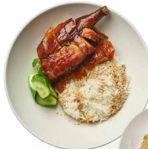
54 DUCK & CHAR SIU RICE 燒鴨叉燒拼飯 $28.00