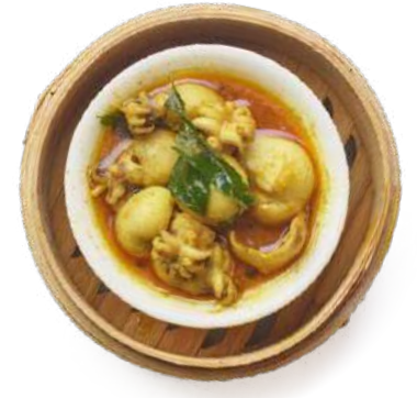
14 CURRY BABY CUTTLEFISH 咖喱墨魚仔 $10.00