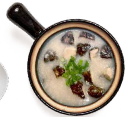
29 SALTED CHICKEN AND MUSHROOM CONGEE 蘑菇鹹雞粥 $16.00