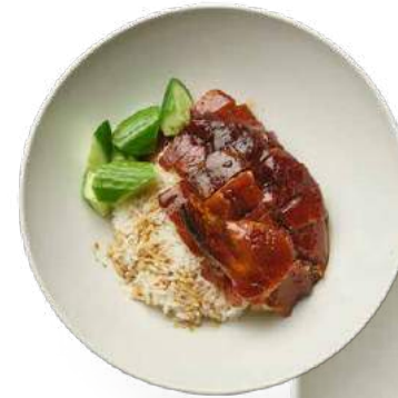
53 DUCK & RICE 燒鴨飯 $26.00