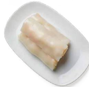
25 PRAWN CHEUNG FUN 鮮蝦腸粉 $11.00