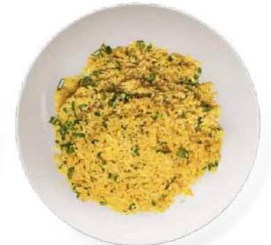
59 EGG AND SCALLION FRIED RICE 蔥花蛋炒飯 $18.00