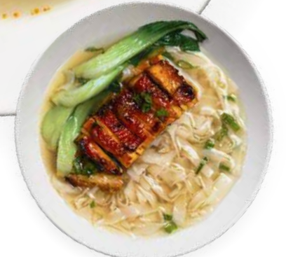
47 CHAR SIU CHICKEN HO FUN SOUP 雞叉燒河粉湯 $23.00