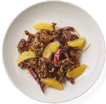
35 CRISPY SHREDDED BEEF 香橙炒牛絲 $28.00