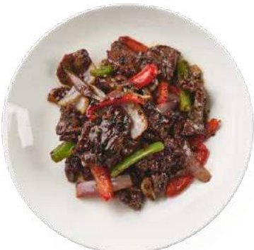
37 BLACK PEPPER BEEF 黑椒醬牛腩 $29.00