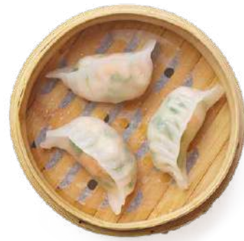
07 PRAWN AND CHIVE DUMPLING 韭菜蒸蝦餃 $12.00