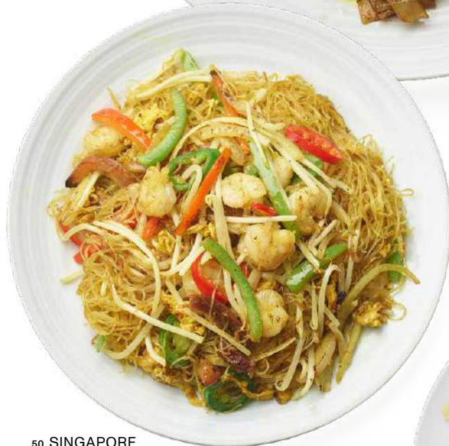
50 SINGAPORE FRIED NOODLE 新洲炒米粉 $22.00