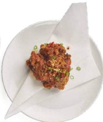
42 SALT & PEPPER QUAIL 油烹椒鹽鶉鴉 $29.00