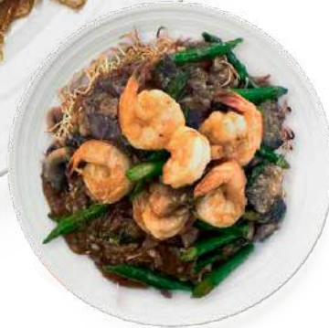
51 XO PRAWN CRISPY NOODLE xo蝦球脆麵 $30.00