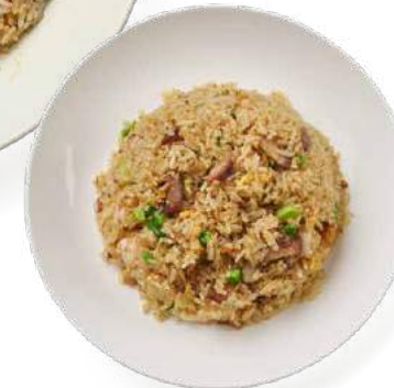
56 YANGZHOU FRIED RICE 揚州炒飯 $24.00