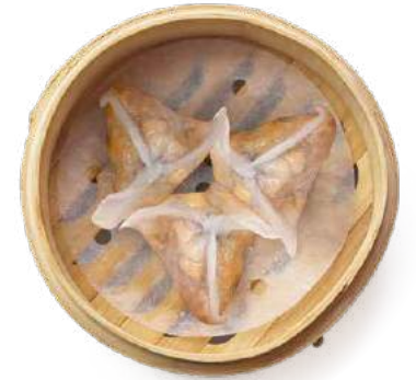
13 SEASONAL MUSHROOM DUMPLING 時令香蕈餃 $10.00