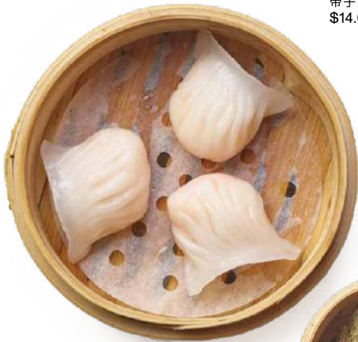
01 HAR GAU 笋尖鮮蝦餃 $12.00