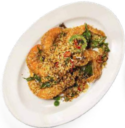
39 GARLIC BLUE SHRIMP, SHELL ON 蒜香椰絲烹法國藍蝦 $31.00