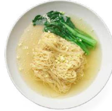
44 WONTON NOODLE SOUP 雲吞湯麵 $21.00