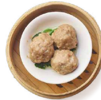
09 BEEF BALL WITH WATERCRESS 陳皮牛肉丸 $12.00