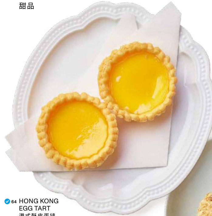
64 HONG KONG EGG TART 港式酥皮蛋撻 $8.00