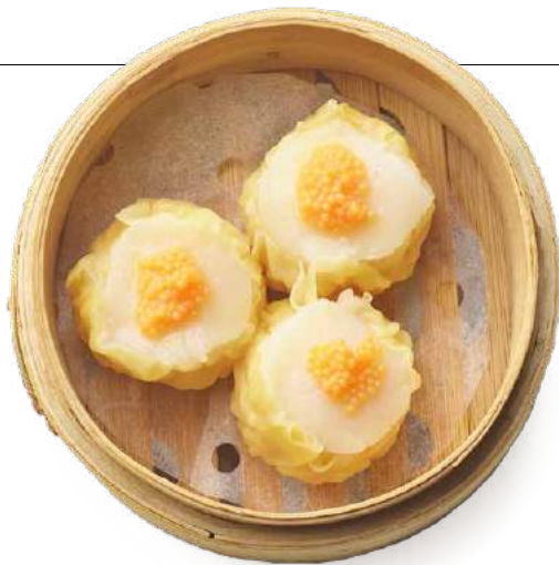
★03 SCALLOP SHUMAI 帶子蒸燒賣 $14.00