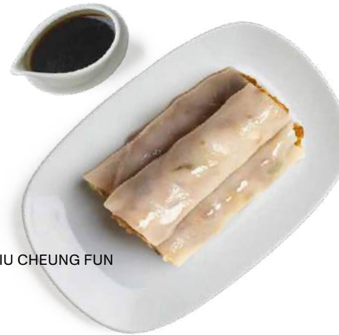
24 CHAR SIU CHEUNG FUN 叉燒腸粉 $9.00