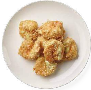
38 WASABI PRAWNS 芥末醬蝦球 $31.00