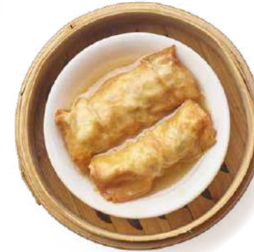
11 BRAISED YUBA ROLL 傳統鮮竹卷 $10.00