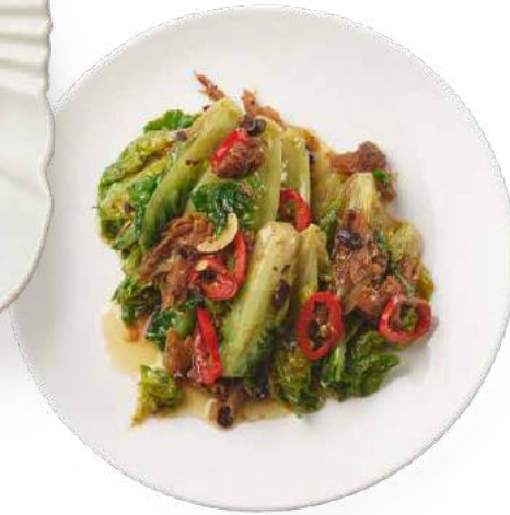
63 BABY GEM LETTUCE & FRIED DACE BLACK BEAN 豆豉鯪魚娃娃菜 $18.00