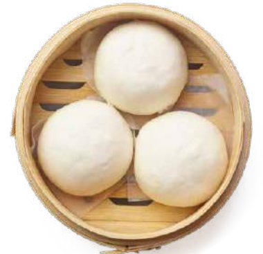
15 CUSTARD BUN 港式奶黃包 $10.00