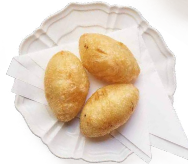
19 HAM SUI GOK 安蝦鹹水角 $10.00