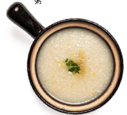
28 PORK CONGEE WITH CENTURY AND SALTED EGG 皮蛋瘦肉粥 $16.00