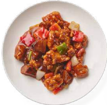
36 SWEET & SOUR CHICKEN 糖醋古老雞 $26.00