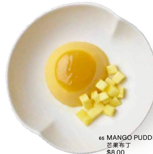
65 MANGO PUDDING 芒果布丁 $8.00