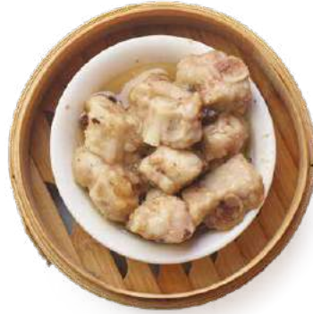
06 PORK RIBS AND TARO, BLACK BEAN, RED CHILLI 芋頭蒸排骨 $10.00