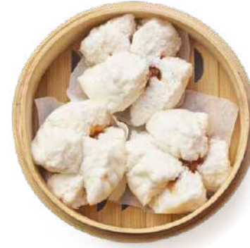
08 CHAR SIU BAO 古法叉燒包 $10.00