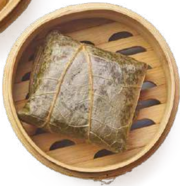
04 LOTUS LEAF GLUTINOUS RICE 荷香糯米雞 $10.00