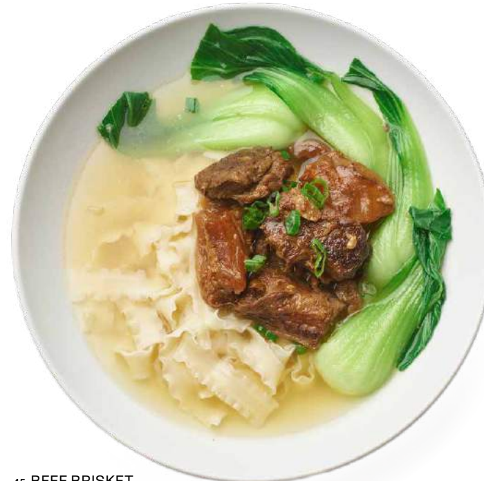
45 BEEF BRISKET NOODLE SOUP 諸侯牛腩麵 $24.00