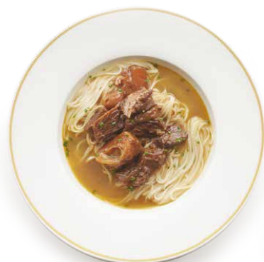
41 BRAISED BEEF BRISKET NOODLE SOUP 諸侯牛腩麵 $22.00