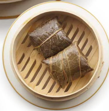
04 LOTUS LEAF GLUTINOUS RICE 荷香糯米雞 $10.00