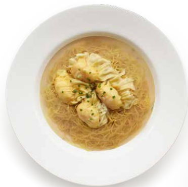
39 WONTON NOODLE SOUP 雲吞湯麵 $18.00