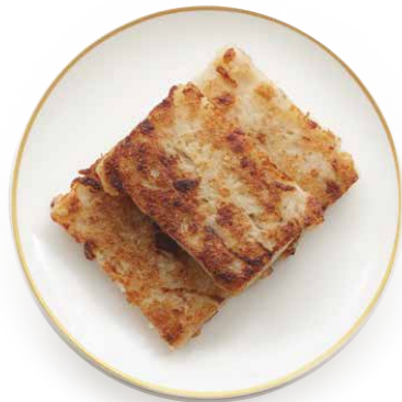
🏆 18 PAN FRIED MOOLI CAKE 香煎萝卜糕 $8.00