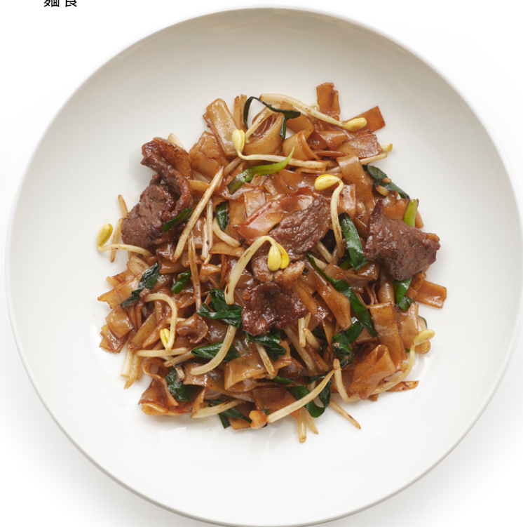
🔵 42 BEEF CHOW FUN 干炒牛肉河 $23.00