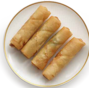
🌿 23 VEGETABLE SPRING ROLL 素菜絲春卷 $12.00