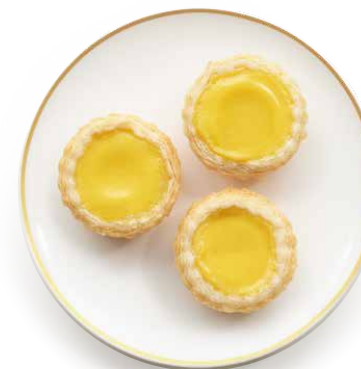
🔵 51 HONG KONG EGG TART 港式酥皮蛋撻 $8.00