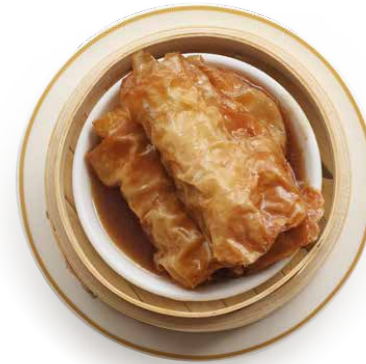
12 SQUASH AND PINE NUT DUMPLING 南瓜風車餃 $10.00