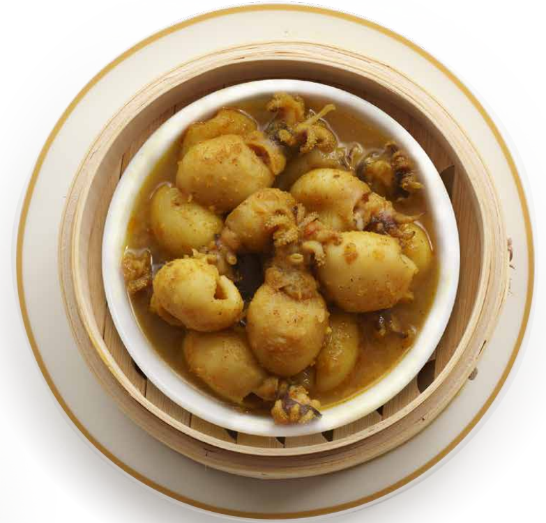
14 CURRY BABY CUTTLEFISH 咖喱墨魚仔 $10.00