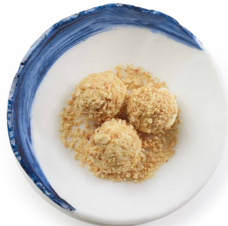
53 BLACK SESAME MOCHI, CRUSHED PEANUT 黑芝麻雷沙湯圓 $8.00