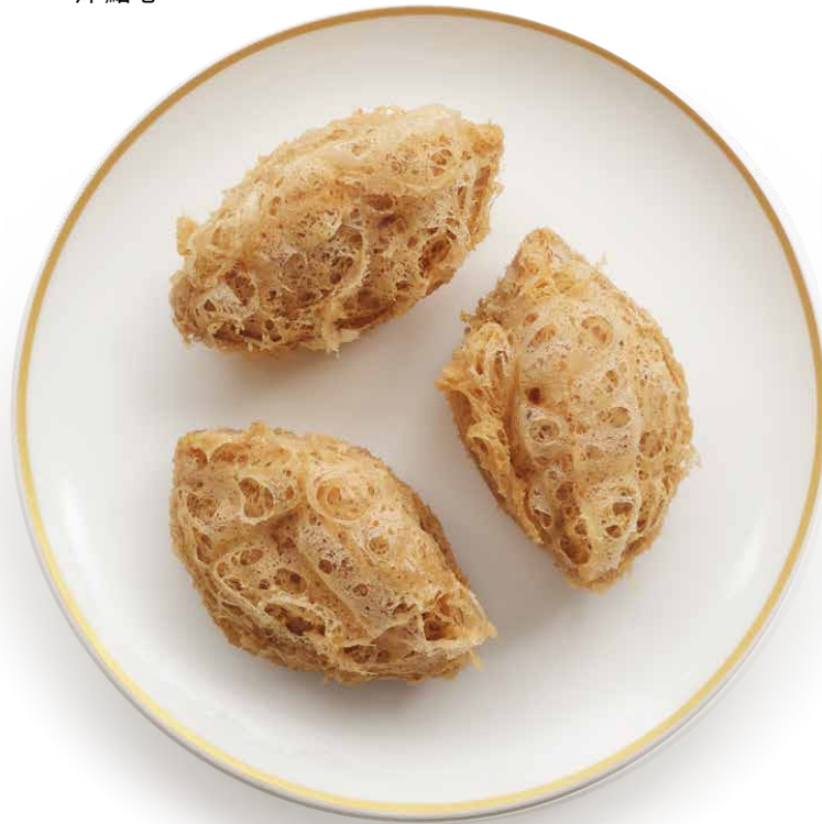
🏆 16 TARO CROQUETTE 蜂巢荔芋角 $10.00