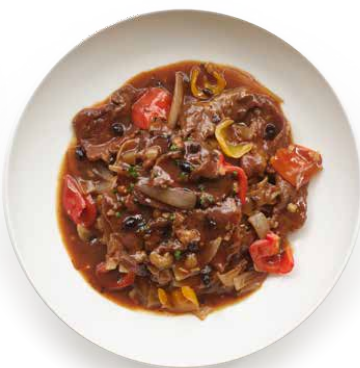
43 BEEF AND BLACK BEAN HO FUN 豉汁牛肉河 $23.00