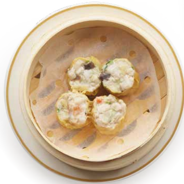
02 SHUMAI 猪肉蝦燒賣 $12.00