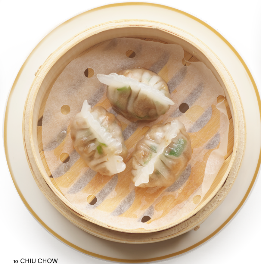
10 CHIU CHOW DUMPLING 潮州蒸粉粿 $10.00