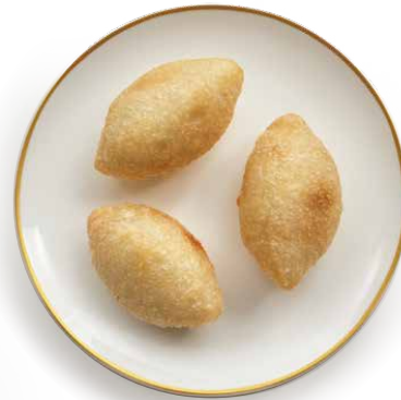
21 HAM SUI GOK 安蝦鹹水角 $10.00